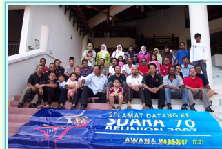
Sdara76 with their family