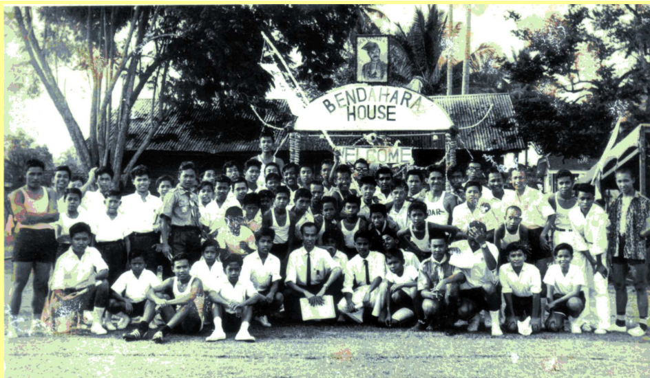
di tingkatan lima Sdar tanjung malim 1963