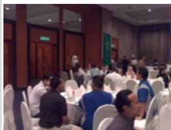
Menunggu waktu berbuka